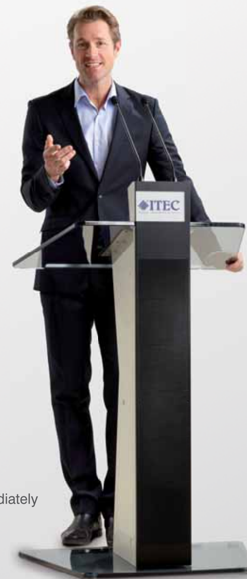
Ready to use immediately

The PRESENCE lectern, including your entire audio system, is ready to use within just 30 seconds: Set it up, turn it on, and that's it!