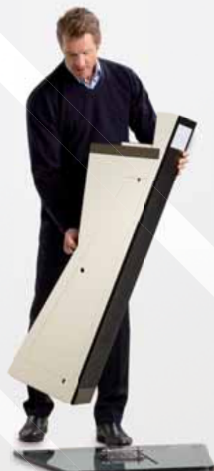
Set up in no time